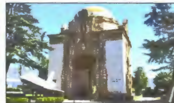
Portal of Folded Wings